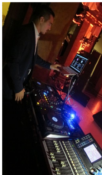
Option : DJ set-up (after Goldsingers)